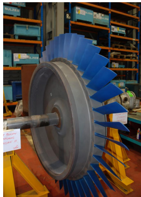
Rotating turbine blades with HICoat A08