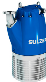
Submersible drainage pump XJ 900