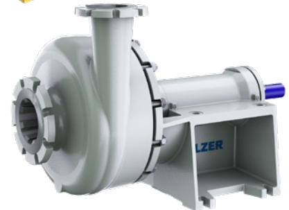
PLR slurry pump