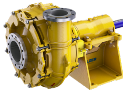
EMW heavy-duty slurry pump

In long-distance pumping applications, high-pressure pumps are required to allow staged pumping.