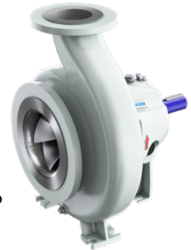
SNS process pump