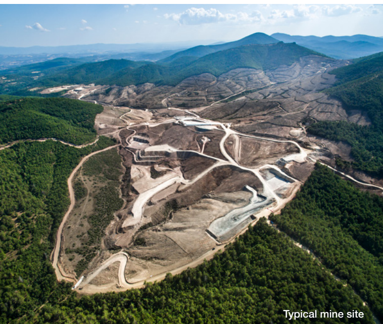
Typical mine site

Comminution – the ore starts off as large rocks and undergoes a series of steps to reduce its size so that the desired metal may be separated from the rock. The initial crushing and screening are dry processes and water is not added into the process until the ore gets to the grinding mills. Here the particle size becomes small enough to liberate the commodity from the rock through a separation process before it is finally thickened for the refining and finishing process. Methods for separation depend on the ore type, e.g. screening, gravity, dense medium, magnetic or flotation, resulting in the desired product in the form of a concentrate. The waste generated from the process forms the largest volume, and this then must be disposed of safely.